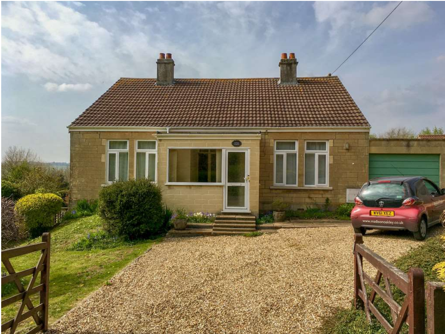
Little Garth, Padleigh Hill, Englishcombe, Bath, BA2 9DW